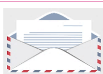
( email - letter )