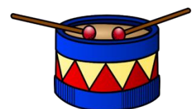
( tone - drum )