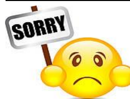
( apologize - import )