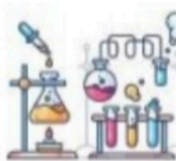
( staff - test tube )