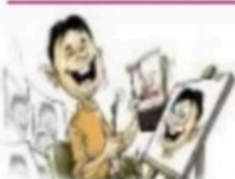
( animator - designer )